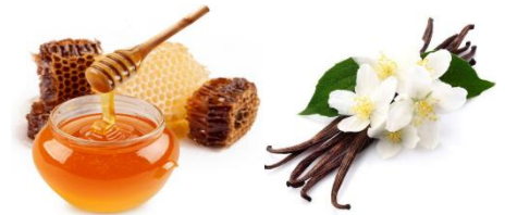
Honey and Vanilla provide a sensational fragrance with moisturizing benefit.