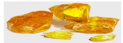
Amber particles exfoliate the skin and provide a pleasurable pine resin scent.