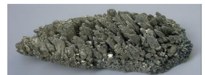
Magnesium Glucomate helps stimulate the synthesis of collagen boosting amino acids

Amber Honey Vanilla Cleansing Scrub uses Amber as the exfoliating ingredient.